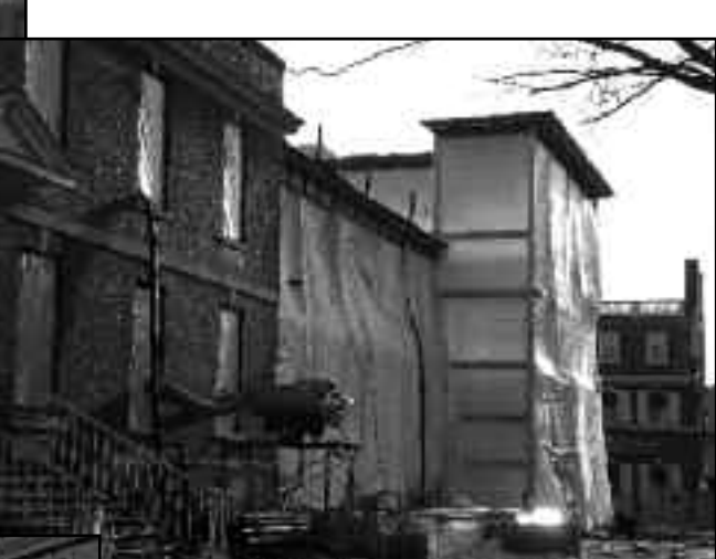
North Side Construction, January 2008