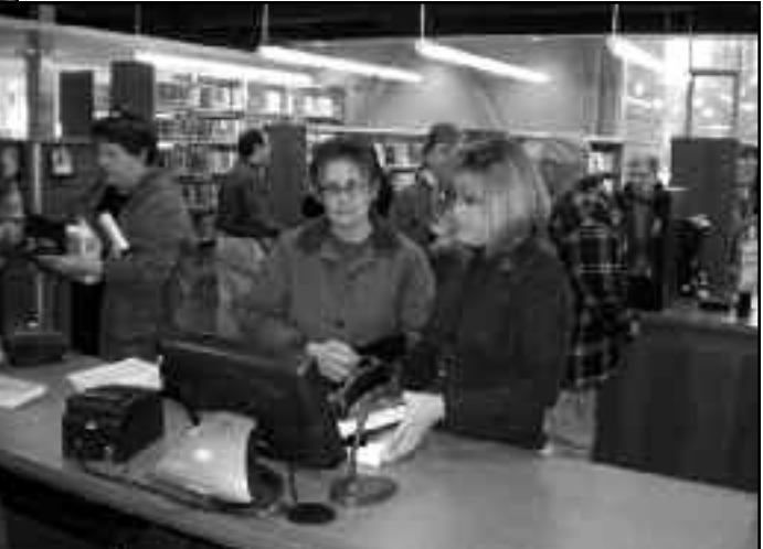
Opening Day, December 11, 2008