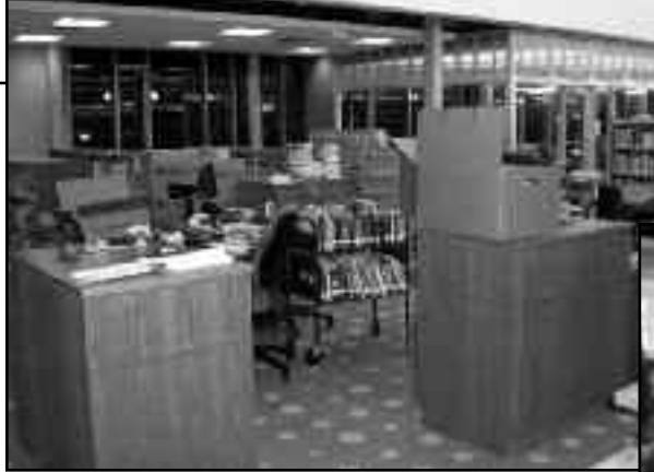
Children's Services During Move, November 2008