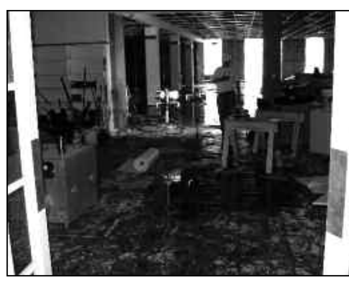
Construction, July 2007