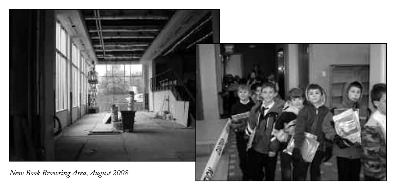
Children Assisting in the Move, November 2008