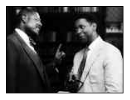
The Great Debators