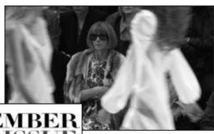
THE SEPTEMBER ISSUE