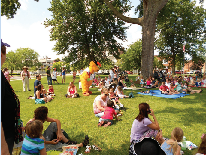
The Summer Reading Program Kick-off Party and Parade drew numerous family and friends to City Park. Adirondack Phantoms' mascot Dax, visits with the kids.