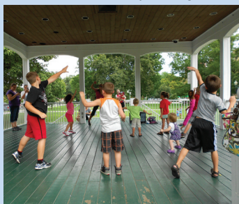
Young patrons enjoy learning Zumba at the City Park gazebo.