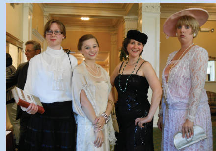
Staff & volunteers add ambience to the Gala by mingling with guests in period attire.

Every effort has been made to ensure the accuracy of our donor lists. Please notify Crandall Public Library's Development Office of corrections at 792-6508, ext. 284.