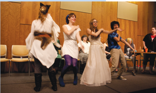
Teens performing in the show Murder at the Miss Management Pageant , a benefit for Prospect School.

The Teen Center saw 14,849 uses in 2012. The Teen Advisory Group met several times during the year to ensure the Teen Center met the needs of our audience, and as a result, we began several new programs including Japanese Culture Club and a Dungeons and Dragons campaign, both of which now meet every week. We continued our commitment to supporting teens in their education and provided homework help when appropriate, as well as reaching out to area high schools with on-site visits from the librarian. Our social club, the Reduced Teen Group, also thrived, putting on our first fully staged Shakespeare play, A Midsummer Night's Dream . It is important to the teens to give back to the community, and this year the charities that benefitted from their generosity included the ASPCA and South Glens Falls Dance Marathon.