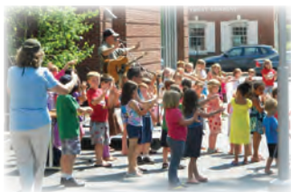
Summer Reading Kick-off Party

programs encompassed the science of ice cream, Spanish language classes, fashion design, a cartooning workshop, family concerts, puppet making, storytelling, a therapy dog panel, a Pokémon game event, and Wacky Science . Karate programs and numerous Legos programs drew crowds. Additional program series included Treasure Seekers (the Library scavenger hunt), Tweens Knit , and Reading to Therapy Dogs .