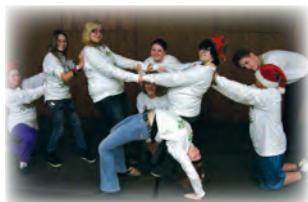
The cast of the “Shakespeare’s Sonnets”

2014 was an amazing year for the Teen Center. The Teen Advisory Group (TAG) met regularly to guide the staff in planning programs and collection development. With their help, we provided such offerings as a teen art show, events with the Sister Cities committee, Yu-Gi Oh! and other card tournaments, and ArtWalks .