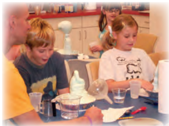
Making science fun!