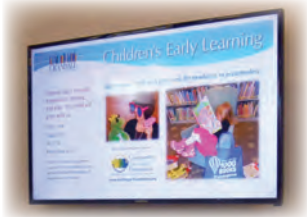
Friends Community Screen