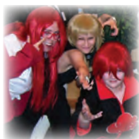
Cosplay fashion show