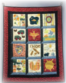
Crandall Keeping Quilt

School-age and tween programming increased with the addition of the weekly Artblast! , art projects for kids in kindergarten and up, and Sunday Special program series. Topics and activities for Sunday Special varied each week. Many programs to appeal to a wide range of interests were offered to kids of all ages throughout the year. These programs ranged from Kitchen Science , to a magic show, to Dirt Detectives . We made our annual field trip to the Ballet at SPAC funded by The Friends of the Library. The library-wide Batman Day was very busy in the Children's Department where families were offered four different activities. The Crandall Kid's Garden Club members planted, tended, and harvested a community garden plot on the corner of May and Bay Streets in Glens Falls. The annual Teddy Bears Picnic was a tradition enjoyed by all. The wildlife program featuring live animals drew a large crowd. Other