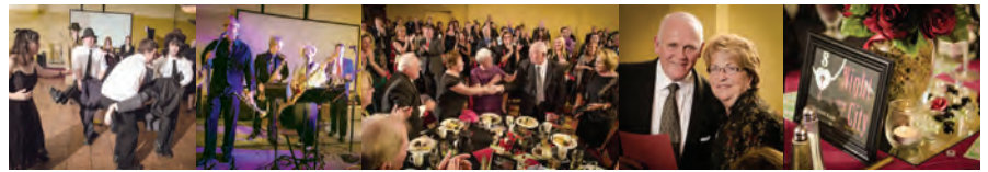
Murder, mystery, hot dance tunes, family, friends, dignitaries, generosity and fun were the highlights of Gala Noir.