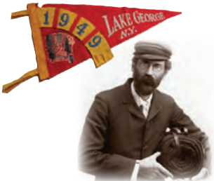
Collecting Lake George