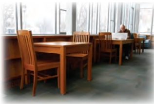
Quiet Reading Room