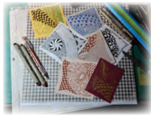
Crandall Crafters Zentangle

The Library is a Wi-Fi hotspot, and patrons increasingly bring their laptops and smaller devices to the building and work at chairs or tables located throughout the building. Reference questions are increasingly about helping patrons cope with technology integration into their daily lives and about how to use various devices. Ongoing monthly programs for adults included: Memory Sharing Group , Literary Knits , two book discussion groups, Crandall Crafters and 1-on-1 Tech Time . Scattered throughout the year were classes on planning your vacation, a music program celebrating the 50th anniversary of the arrival of the Beatles in NY. Author visits by David Fiske, author of Solomon Northup: His Life Before and After Slavery , Dan Hazewski, a local financial planner who discussed his book, Exit Right: Avoiding Detours and Roadblocks along the Baby Boomer Highway . Author Dolores Carruthers, a retired psychotherapist presented a workshop on Coping Strategies for Grief During the Holidays and Beyond , and Marty Podskoch, author of Adirondack 102 Club presented information on a plan to encourage people to visit all 102 towns and villages in the Adirondacks.