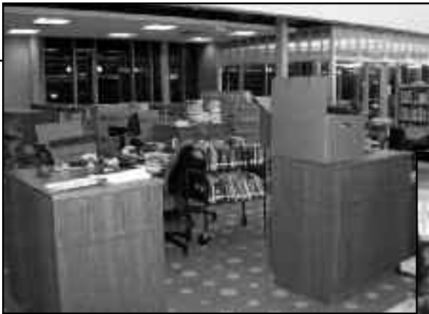
Children's Services During Move, November 2008