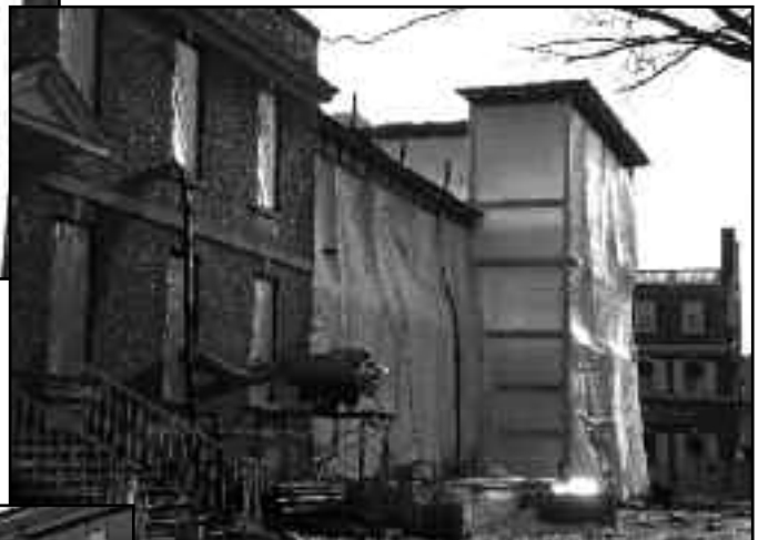
North Side Construction, January 2008