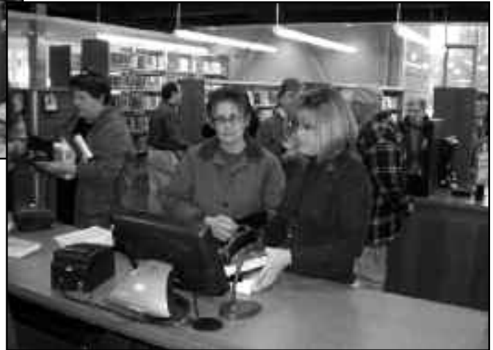
Opening Day, December 11, 2008