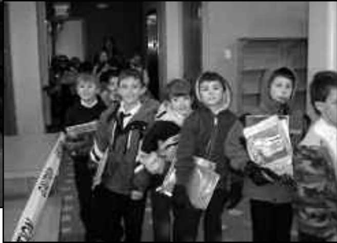
Children Assisting in the Move, November 2008