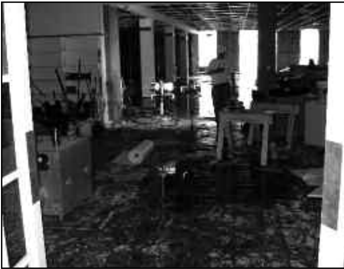
Construction, July 2007