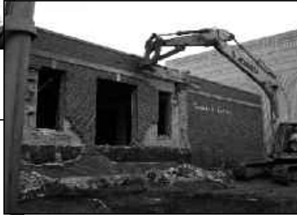
Demolition, July 2007