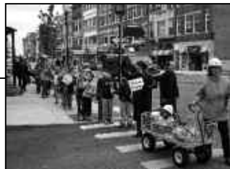
Children Helping with the Move

As the expansion project grew to completion, we worked to grow new users. We brought many children and families into the library through creative programming. 18,759 people attended the 652 children's programs and 1,170 attended 82 teen programs offered in 2008. The summer reading program set a new record for enrollment of over 1,000 children, teens, and adults. Programs encompassed a wide range of interests from literacy to science exploration and were available to all age groups from babies to teens: