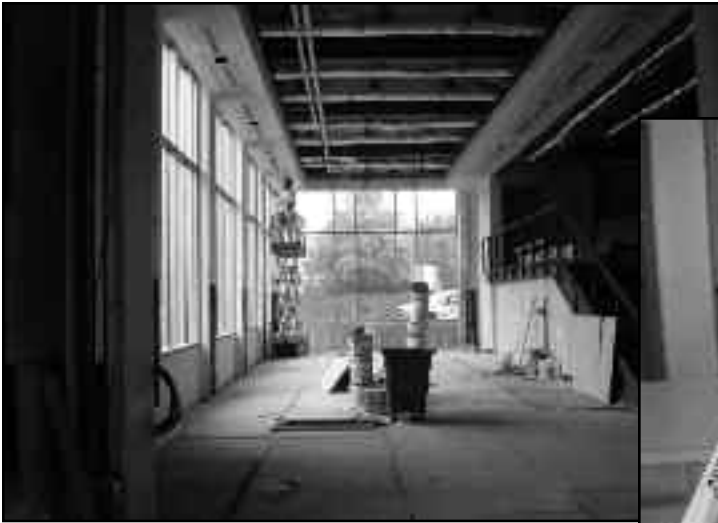
New Book Browsing Area, August 2008