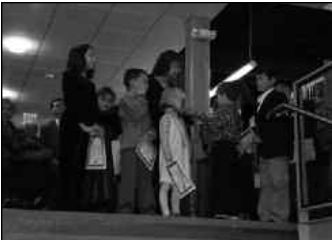
Dedication Evening Youthful Ribbon Cutters, December 12, 2008