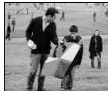
The Kite Runner

Summer/Fall: Once , Taxi to the Dark Side , There Will Be Blood , Nanking , The Great Debaters , Enemies of Happiness , Michael Clayton , The Counterfeiters , Up the Yangtze and Note By Note .