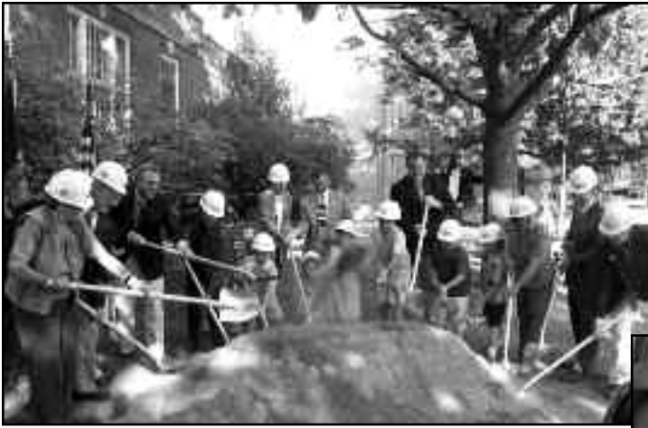
Groundbreaking, May 23, 2007