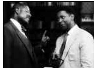
The Great Debaters