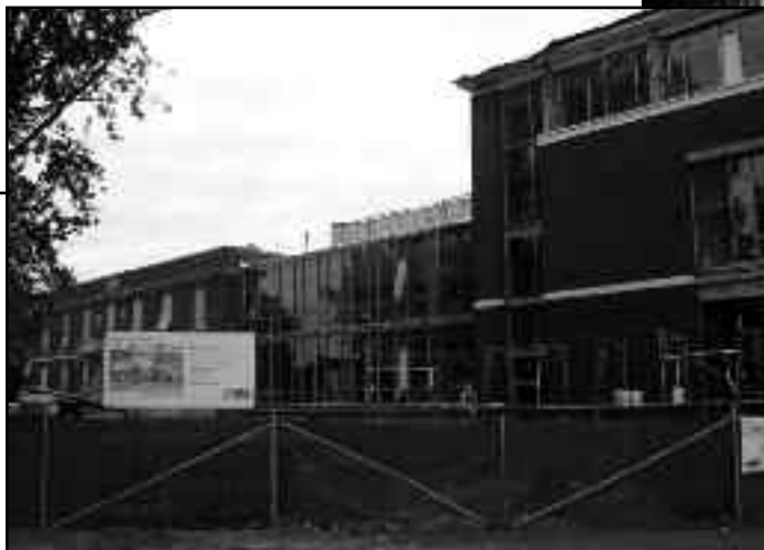
Construction Site, June 2008