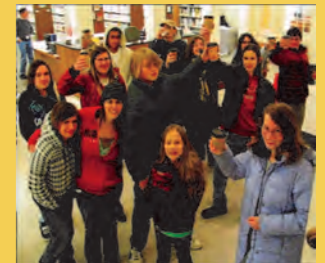
Picture, Teens Collect Items for Charity.

wholesome and inexpensive. Furthermore, teens have even learned at Reduced Teen Group how to make homemade salsa and Hungarian goulash.