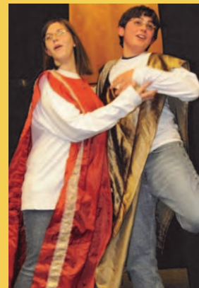
Picture, The Reduced Shakespeare Company.

We have over a thousand uses of the Teen Center every month, ranging from book clubs to live theater. We've done hundreds of pages of writing, field trips to sports events and pizza places, and volunteered in the community.