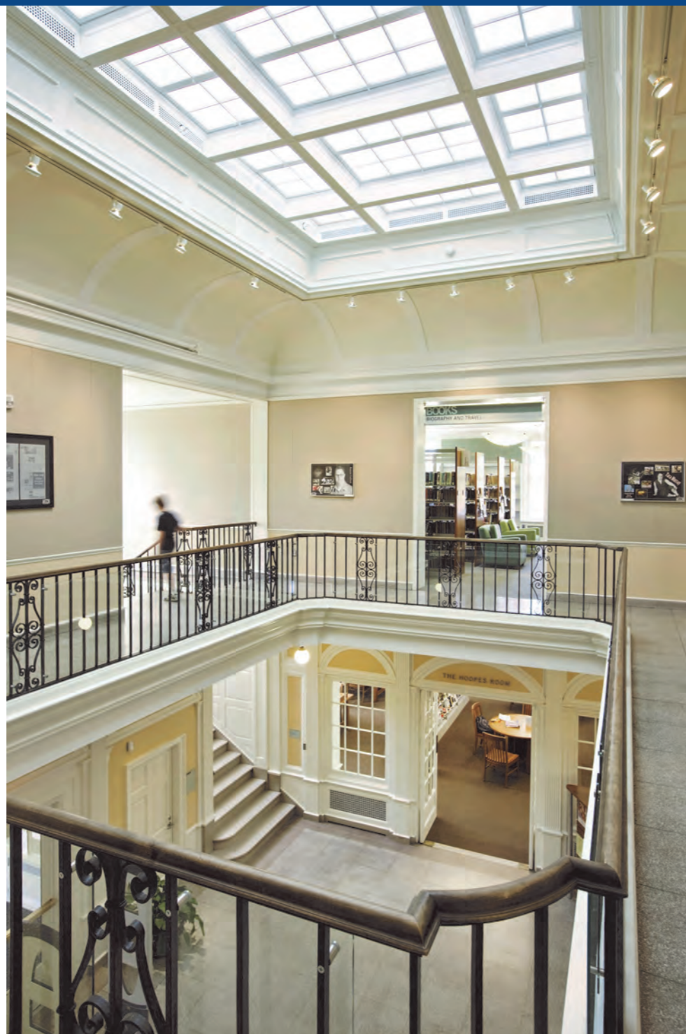
Remember when this doorway was the entrance to the Children’s Department? Atrium Skylight from 2nd Floor Ann Beha Architects

Every effort has been made to ensure the accuracy of our donor list. Please notify Crandall Public Library of corrections at 518-792-6508, ext. 284.